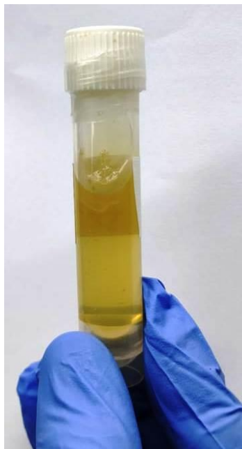
SF5: Stab culture of the colony PCR positive cells showing bacterial growth on 1% Luria-Bertani Agar slant containing ampicillin (100 mg/ml) after overnight incubation at 37°C