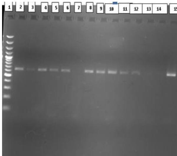
SF4: Colony PCR of the transformed cells to amplify the partial VP2 gene of CPV-2. Lane 1: 100 bp plus Gene ruler, Lane 2: Positive control (vaccine DNA), Lane 3 to 13 and 15: Transformed colonies, and Lane 14: Negative control