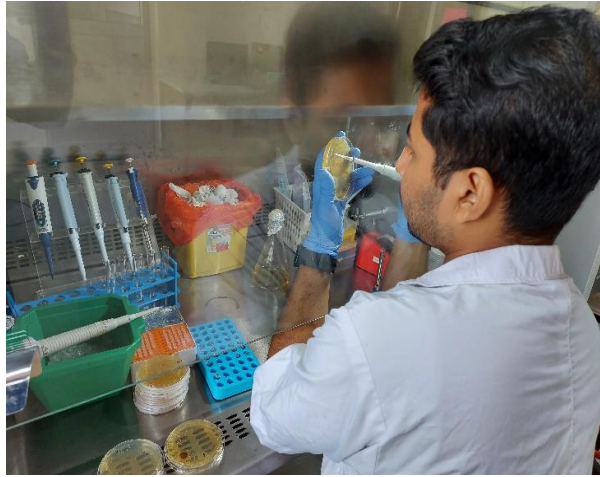
SF3: Picking of transformed cells for colony PCR