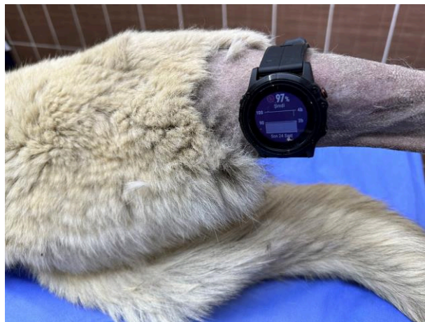
Fig. 1: Illustration demonstrating the positioning of the Garmin Fenix 5X plus smart wearable device on the tibia to collect arterial hemoglobin oxygen saturation readings

manually recorded by the same person. Two individuals, one for the GF5Xp and another for the TPO, simultaneously collected the recordings. The GF5Xp measurements were obtained by pressing the activation button on the wearable device. For each dog, the GF5Xp and TPO data were recorded at one-minute intervals for 20 min. Following the surgery, the connections of the GF5Xp and TPO were removed, and the animal was then moved to the recovery room.