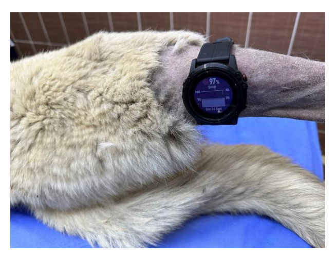
Fig. 1: Illustration demonstrating the positioning of the Garmin Fenix 5X plus smart wearable device on the tibia to collect arterial hemoglobin oxygen saturation readings

manually recorded by the same person. Two individuals, one for the GF5Xp and another for the TPO, simultaneously collected the recordings. The GF5Xp measurements were obtained by pressing the activation button on the wearable device. For each dog, the GF5Xp and TPO data were recorded at one-minute intervals for 20 min. Following the surgery, the connections of the GF5Xp and TPO were removed, and the animal was then moved to the recovery room.