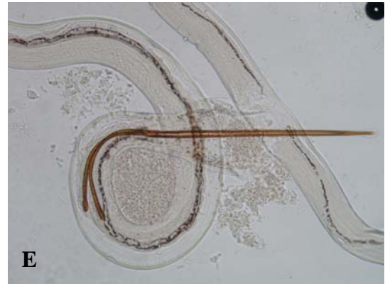
Fig. 1: Identified helminthes from dromedary in Iran (for the first time). A: Trichostrongylus culobriiformis , B: Trichostrongylus probolurus , C: Nematodirella dromedarii , D: Cooperia oncophora , and E: Nematodirus oiratianus