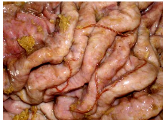
Fig. 2: Haemonchus longistipes with barber pole appearance in hyperaemic and edematous abomasum