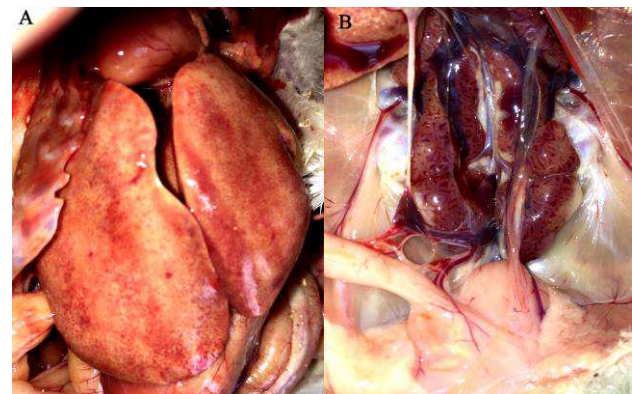
Fig. 1: Gross lesions associated to FAdV-11. (A) White-red marbled appearance of the enlarged liver with marked petechial hemorrhages, and (B) Swollen kidneys with mottled appearance (these findings were not as frequent as liver lesions). Size of bursa is grossly normal for this age

Before reaching the estimated IBD vaccination date, clinical signs of IBH appeared in all houses of the farm B at closely similar ages as farm A (Table 1). Overall, clinical, gross, and histopathological findings of the affected chickens in farm B were similar to what is described above for farm A.