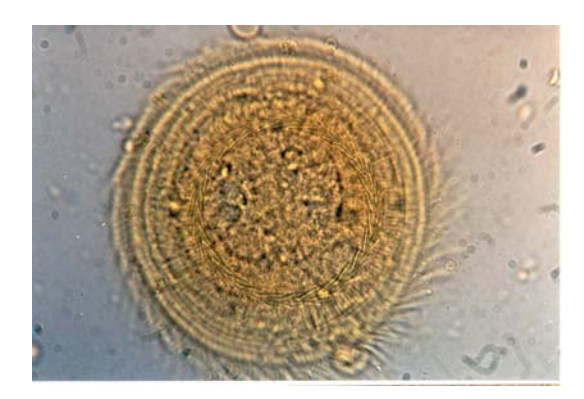
Fig. 1: Trichodina pediculus (×1000)