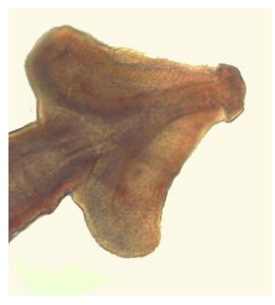
Fig. 5: Umbrelliform scolex of Polyonchobothrium sp. (×400)

100%, but the low intensity indicates the low fish population (Fig. 2).