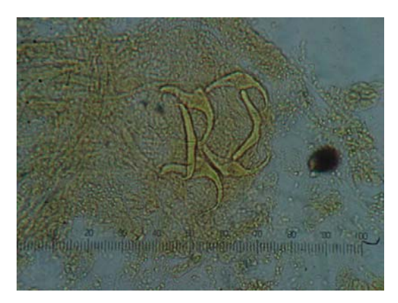
Fig. 2: Mastacembelocleidus heteranchorus (\times 100)