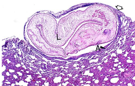
Fig. 1: Thin-walled cyst under visceral pleura (arrowhead) contained turned spinosum parasite (L). Compressive atelectasis (A) around the cyst and interstitial pneumonia are also seen, (H&E, ×46)

Although the parasite is cosmopolitan, it is mainly seen in tropical and subtropical areas. Infection with L. serrata in human cases have been reported from Africa, South America, Southeast Asia and the Middle East (Beaver et al. , 1984; Drabick, 1987;