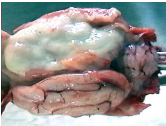
Fig. 1: A widespread purulent leptomeningitis, involve the dorsal portion of the right hemisphere

The surface of pia matter was intact and firmly attached to the adjacent outer layers of the brain, also no evidence of infiltration