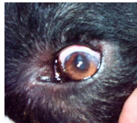
Fig. 4: Posterior synechia in the temporal part of the iris in the left eye 15 days after surgery