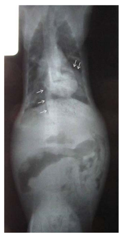
Fig. 2: Ventrodorsal radiograph of the thoracic and abdominal cavities. Notice the big mass consisted of a heterogeneous mixture of soft tissue and gas opasities in caudal part of thorax that is shifted to the left (arrows). The stomach could not be seen clearly in the abdominal cavity. Gastroesophageal intussusception is suspected

esophagus. The pylorus and approximately 2.5 cm of distal stomach remained in the abdomen (Fig. 3). The stomach was congested with dark, purple discoloration of some parts of the body. The rest of the abdomen was explored and no other abnormality was detected. The cranial lung lobes were heavy with almost no air in them and accumulation of foamy discharge in airways.