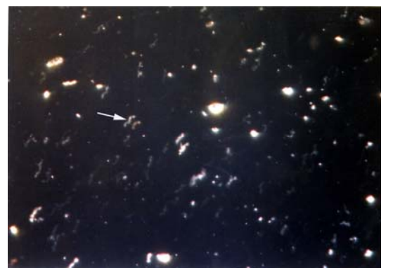
Fig. 1: Leptospiral organisms in dark-field microscope (×400). The organisms can be visualized in black ground contrast (arrow)

Presence of leptospires in histopathological samples was also