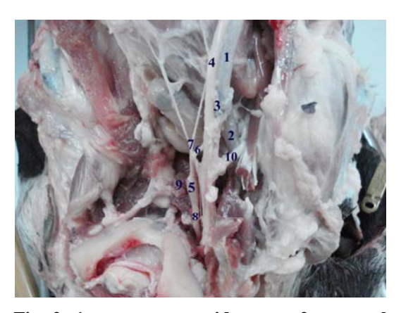
Fig. 2: 1. common carotid artery, 2. external carotid artery, 3. internal carotid artery, 4. vagal nerve, 5. cranial cervical ganglion, 6. external carotid nerve, 7. jugular nerve, 8. internal carotid nerve, 9. rectus capitis ventralis major muscle and 10. glossopharyngeal nerve