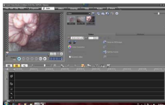
Fig. 2: Cervical tissues image capturing and processing using the software installed in the computer on-farm, connected to the apparatus shown in Fig. 1