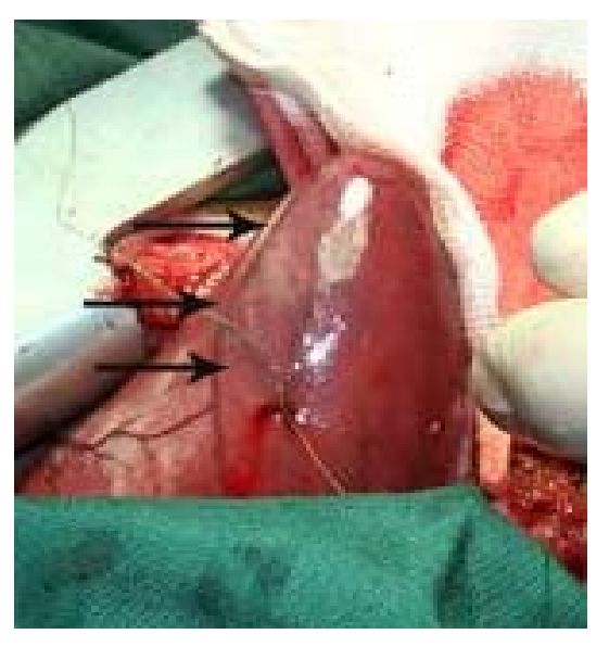
Fig. 1: Cyanotic appearance of area shown by arrows indicated induction of MI

stability were assured, the thoracotomy was closed in layers using standard techniques (pericardium with 5-0 Prolene<sup>™</sup>, muscles and skin with 2-0 Vicryl<sup>TM</sup> sutures) and a chest tube was inserted (Rabbani et al., 2008). The pericardium was not closed. The animals were allowed to recover and were returned to the animal house when able to ambulate. For antiarrhythmic prophylaxis. lidocaine was given as an intravenous bolus dose just before ligation of the diagonal branch (2 mg/kg). Post-operative analgesia was provided by 50 mg pethidine given intramuscularly. Cases were kept at animal ICU for 24 h after the surgery and then were discharged if there were no perioperational morbidities. All animals were studied on the second day after ligation. In group I, the thorax and pericardium were opened, but the LAD were not dissected or ligated. These animals, which comprise the control group, are referred to as "sham-operated" control group hereafter. Monitoring for cardiac function was assessed both clinically (heart rate measurement, typically expressed as beats per minute) and echocardiographically within 2 days after induction of MI. Blood samples were collected from jugular vein and clinicopathological parameters were assessed in both groups.