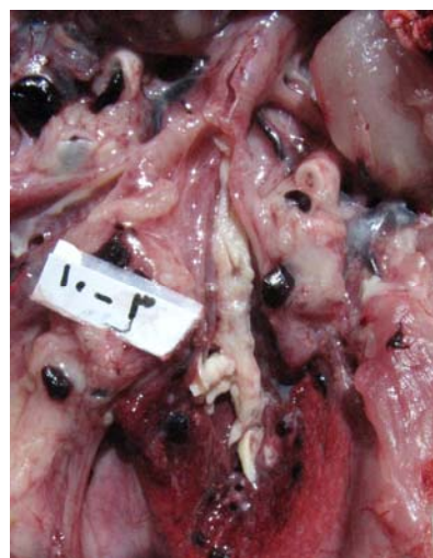
Fig. 3: Tubular cast formation in the bronchial lumen in an AIV and IBV co-infected chicken

The AIV + IBV co-infected group showed the most lesions. The noticeable lesions were tracheal congestion, lung hyperemia, air sacculitis and swollen kidney. Tubular cast formation in the tracheal bifurcation were observed in all dead birds, however, in the AIV + IBV co-infected group these casts extended to the lower bronchi (Fig. 3). Hemorrhage in pancreas and intestine was observed in dead birds in the AIV + IBV co-infected group and also in the AIV infected group (Fig. 4). In this study, no marked gross changes were observed in dead birds of the IBV infected group except mild petechial hemorrhage and congestion of the tracheal mucosa.