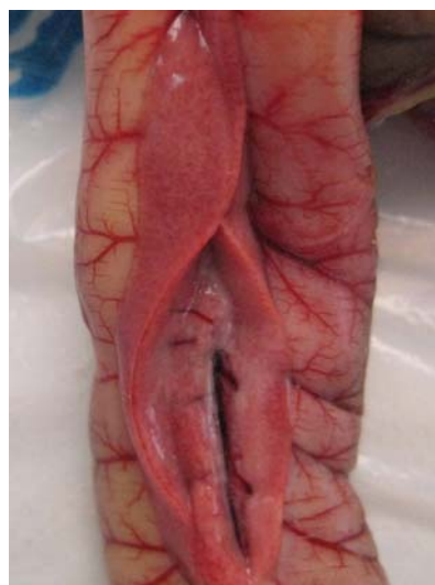
Fig. 4: Hemorrhage in pancreas in a chick inoculated by AIV and IBV