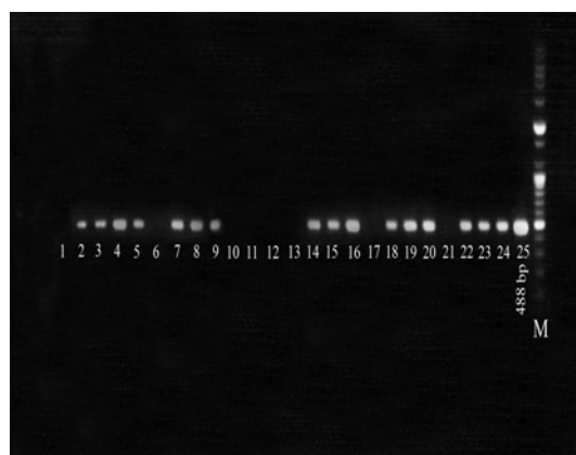
Fig. 2: AIV PCR 488 bp products (H9 protein gene) in 1% agarose. M: DNA marker (100 bp), L25: positive control, L1: blank, L2-5, L7-9, L14-16, L18-20 and L22-24: positive samples, L6, L10-13, L17, and L21: negative samples