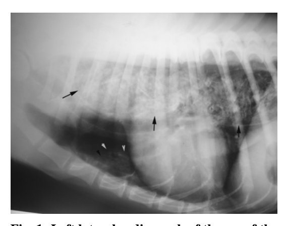
Fig. 1: Left lateral radiograph of thorax of the affected dog with megaesophagus, black arrows: ventral border of esophagus and white arrow heads: alveolar pattern (aspiration pneumonia) dorsal to the third and forth sternebrea